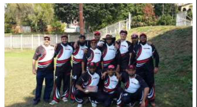
Premier Malls Tiles