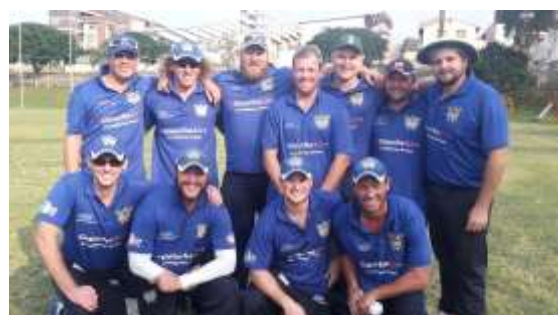
Gauche Air Titans