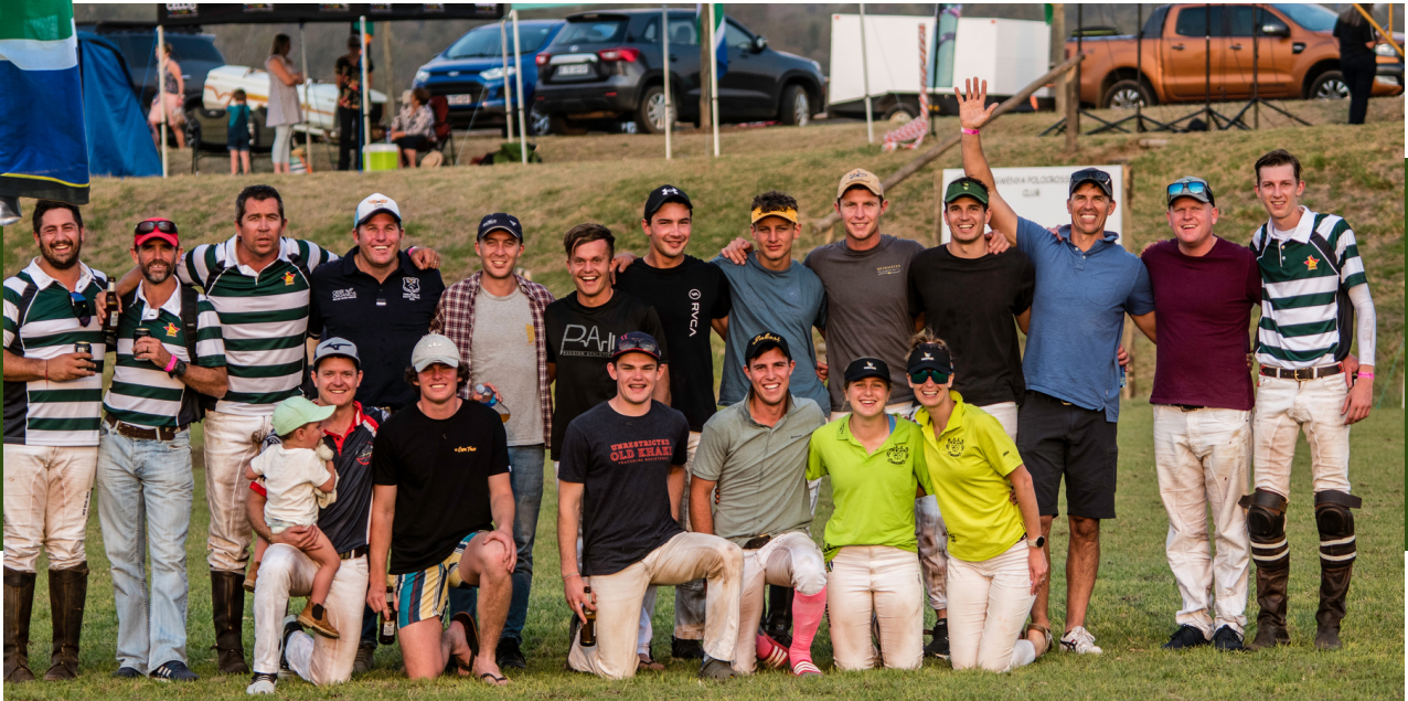
Team SA and Zimbabwe/Zambia at the 2022 Invitational held @ Ngwenya Polocrosse Club September 2022. SA won the series 3-0.